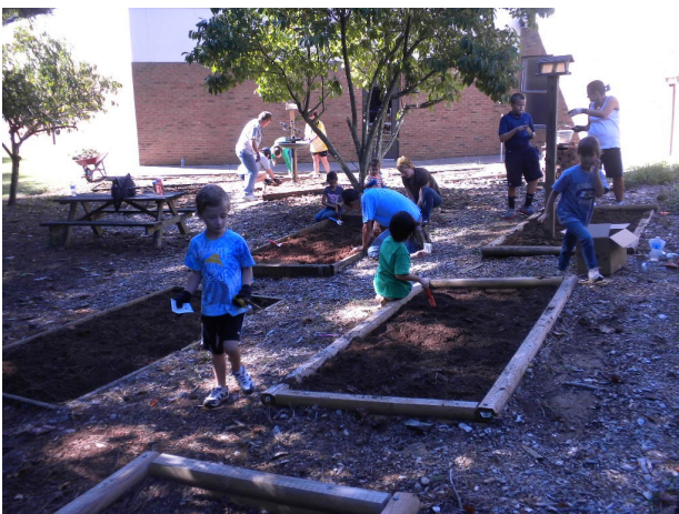
Students working in the garden at Hands on Atlanta

October's character trait is... Responsibility — taking care of one's self and others; to carry out a duty or task carefully and thoroughly . Having a positive attitude and being accountable for your decisions and actions are a great way to portray this trait. You can contribute to a positive school environment by taking pride in Kincaid, being pleasant and dependable, and doing what is right. At school and at home, responsibility is the key to success!