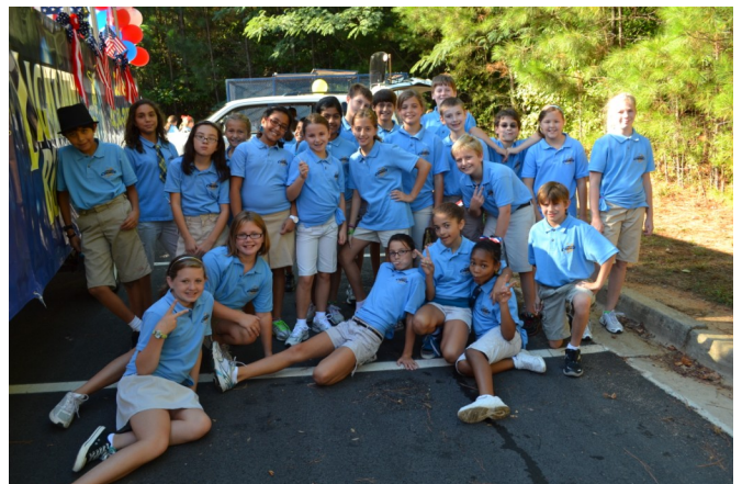
Kincaid Chorus getting ready to Rock the East Cobber Parade